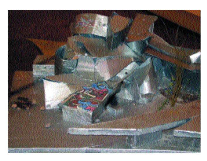
Above: Jason Middlebrook, Guggenheim Bilbao, Part II , 2002. Wood, paint, and polystyrene, 34.25 x 52 x 39 in. Work included in "Paradise/Paradox." Below: Installation view of "Architectures of Gender," 2003, at the SculptureCenter, New York.

the foibles of 20th-century urban planning. On the inner surfaces of this partial Dyson sphere, living space in the form of hundreds of densely clustered high-rise buildings is segregated on two of the rings while the third is empty greenbelt. A drawing by Keefe shows a series of walled enclaves separating city-dwellers from what appears to be unoccupied land. Yet if it's truly empty, why have walls? Finally, Jason Middlebrook mocks present-day notions of heaven on earth with an entropic, post-apocalyptic re-envisioning of Frank Gehry's Guggenheim Bilbao design. The artist gets revenge on a pretentious architect by imagining the building partially collapsed, surrounded by weeds and rubble, and festooned with graffiti.