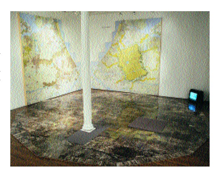
Above left: Natalia LL, Hortus Eroticus , 1995. Photographic installation, dimensions variable. Work included in "Architectures of Gender." Above: Newton Harrison and Helen Mayer Harrison, A Vision for the Green Heart of Holland , 1995–96. Mixed media. installation view.

This is an extraordinary role for artists to play. The Harrisons are engaged in generating a dialogue about key development issues and creating a vision of an alternative that is not driven by economics or limited by national boundaries but instead reflects a determination to consider the whole as a living, breathing entity. Theirs is an art of engagement with political, economic, and social realities, which holds stubbornly to a vision of sustainable land use. The